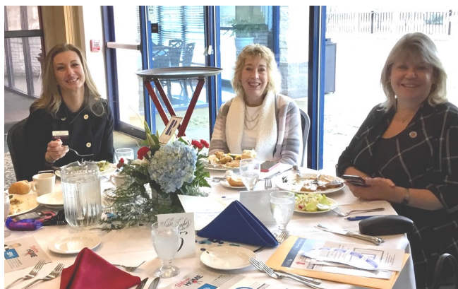
Berkshire Hathaway HomeServices, Moon Twp.