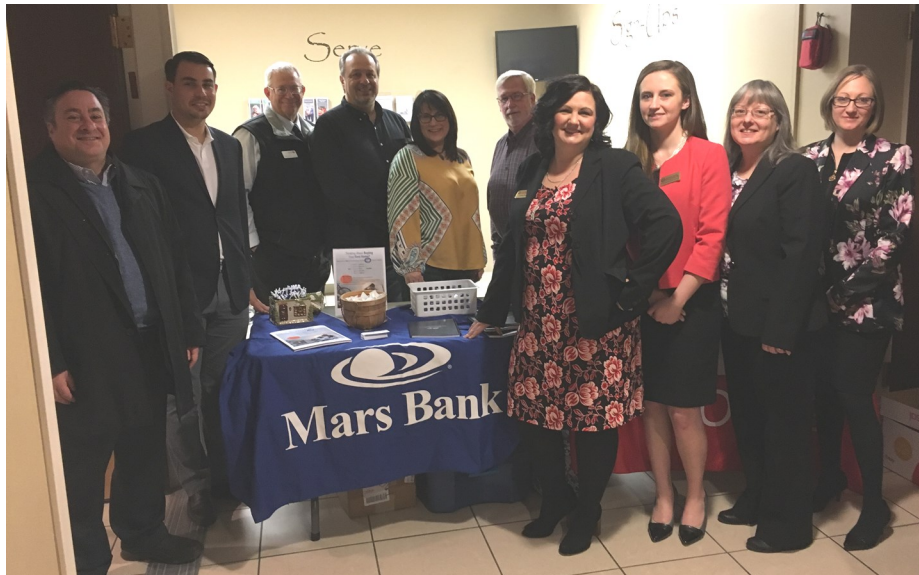
BCAR Affiliates pictured from left: