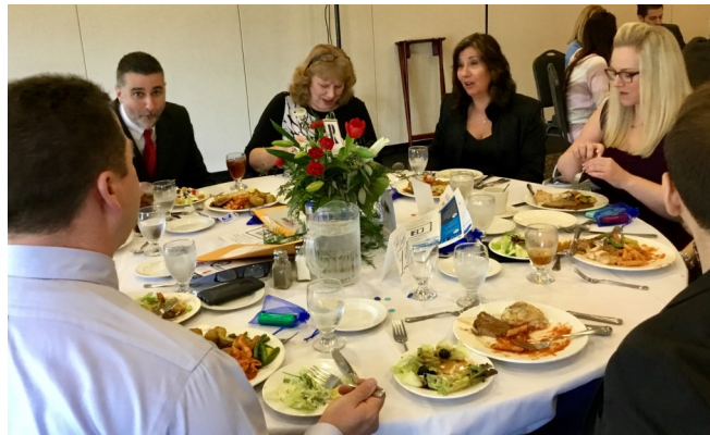
RE/MAX Select Realty—Center Township